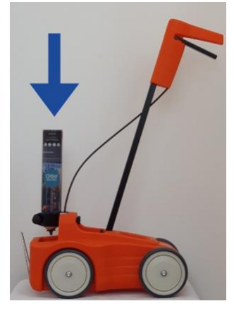
8- Insert the Tracing PRO can vertically until the Soppec PureSPRAY™ nozzle is positionned into the spray activation module.