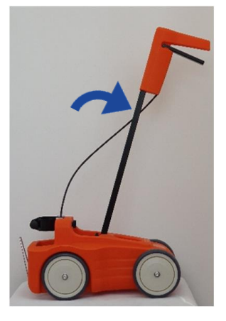
4- Swing the handle-bar backwards.