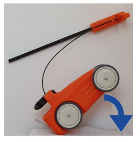
2- Swing the trolley back on its 4 wheels and the handle-bar onto the top side of the DRIVER™ with the handle facing backwards.