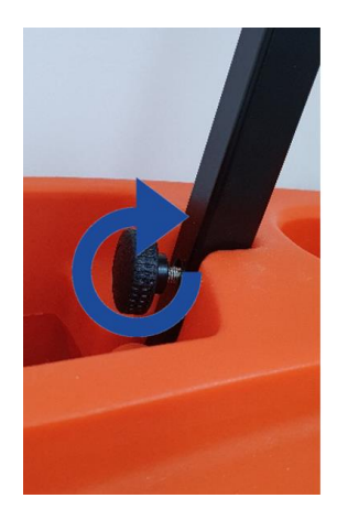
5- Set-up and screw the fixing screw in position.