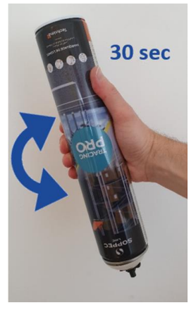
6- Shake the can, headdown, to free-up the internal balls. Keep going-on during 30 seconds minimum.