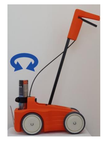
8- Pivot the Tracing PRO aerosol can 90° on both the right and the left sides until you can hear the « Click » which assesses the proper set-up of the nozzle into the spray activation module.