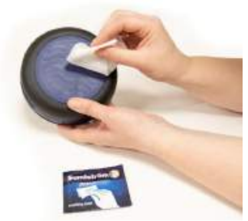
10.4 Clean the pre-filter holders inside and out.