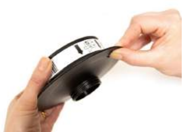
9.2 Grip the filter with one hand.

9.3 Change pre-filter by press it in the middle and then remove it.