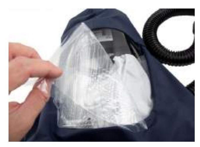
1.1 Remove the protective film from the visor.