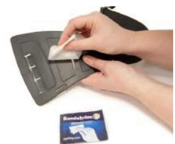
10.6 Wipe the belt clean.

Check that the sealing ridge for the particle filter is undamaged.