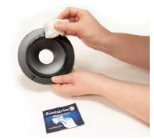
10.5 Wipe the filter adapter clean.

Check that the sealing ridge for the particle filter is undamaged.