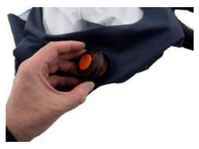
6.3 Snap off the valve cover from the valve seat.