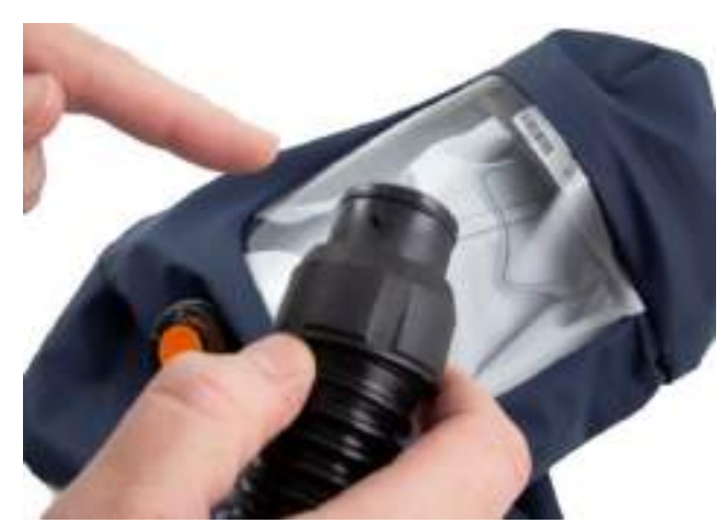
1.2 Check that the O-ring of the hose is in place.