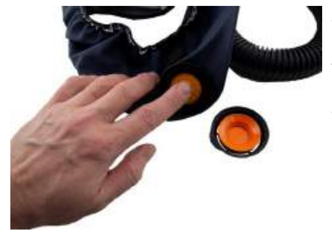
4.3 Press the new membrane onto the pin. Carefully check that the membrane is in contact with the valve seat all way round.