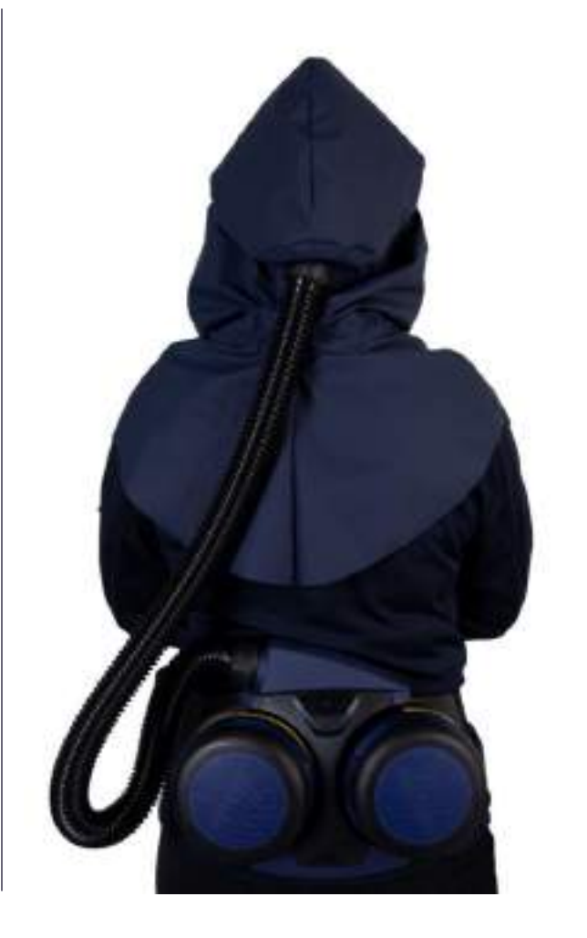
3.5 Make sure that the breathing hose runs along your back and is not twisted.