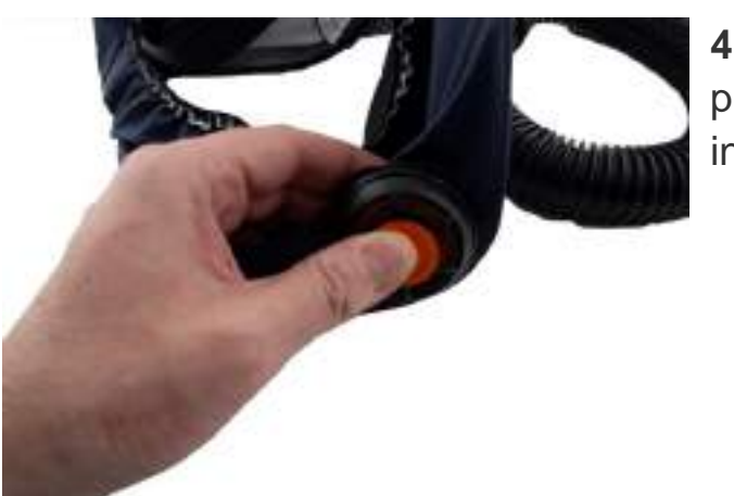
4.4 Press the valve cover into place. A clicking sound indicates that it is in place.