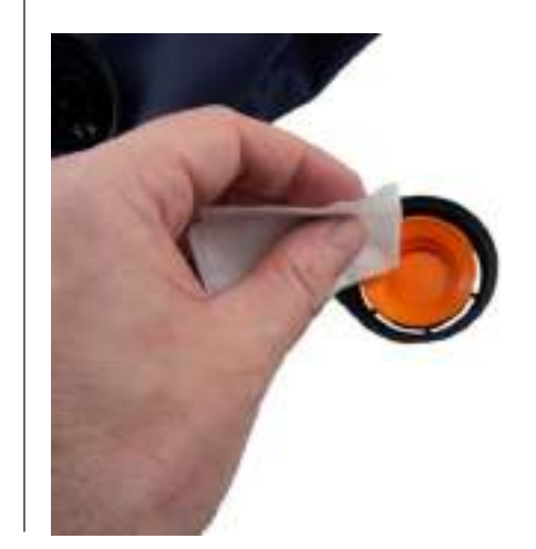
6.6 Clean the valve cover on the inside and outside.