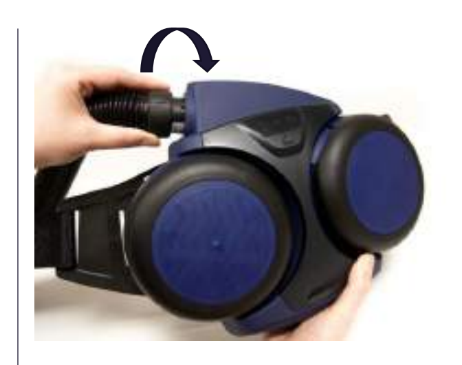
1.3 Connect the hose to the fan unit and turn it clockwise about 1/8 of a turn.