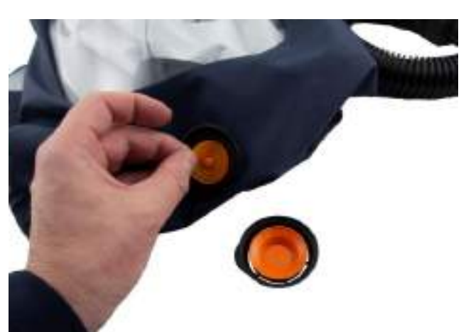
6.4 Slip of the membrane