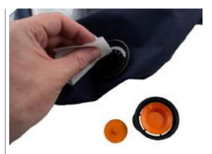
6.5 Clean the valve seat and check that the valve seat is ok.