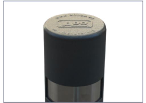
Engraved detail of the logo on the bollard.