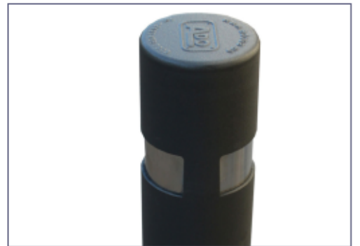
Bollard reinforcement detail avoiding top break.